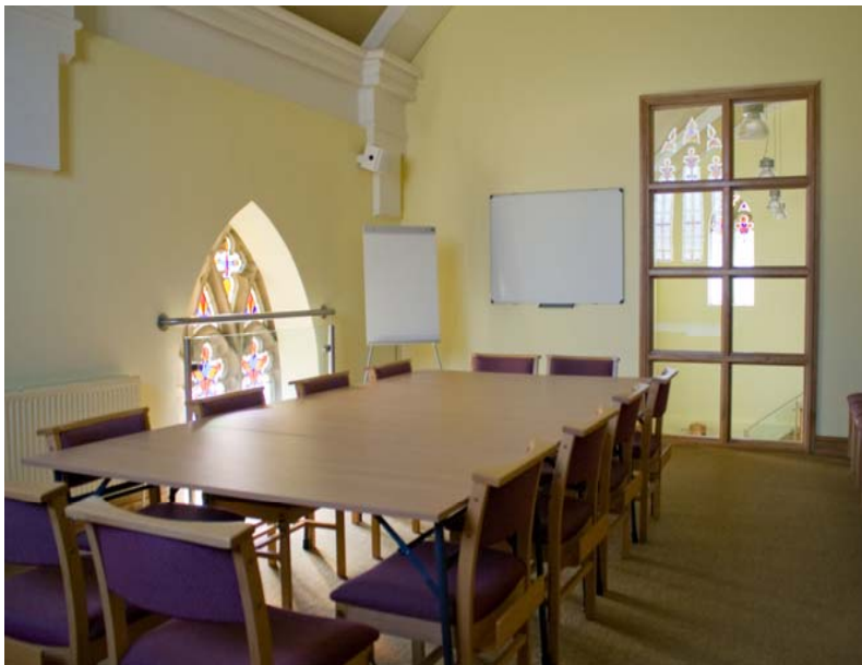
Victoria Park Room (7.3m x 3.7m) – Upper Floor