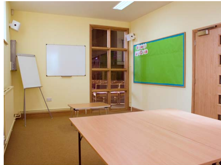
Canton Room (7.3m x 3.7m) – Ground Floor