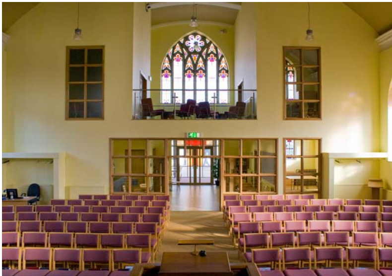
Worship Hall / Meeting Area